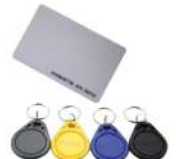
RFID Cards & Tags