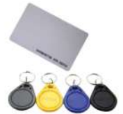
RFID Cards & Tags